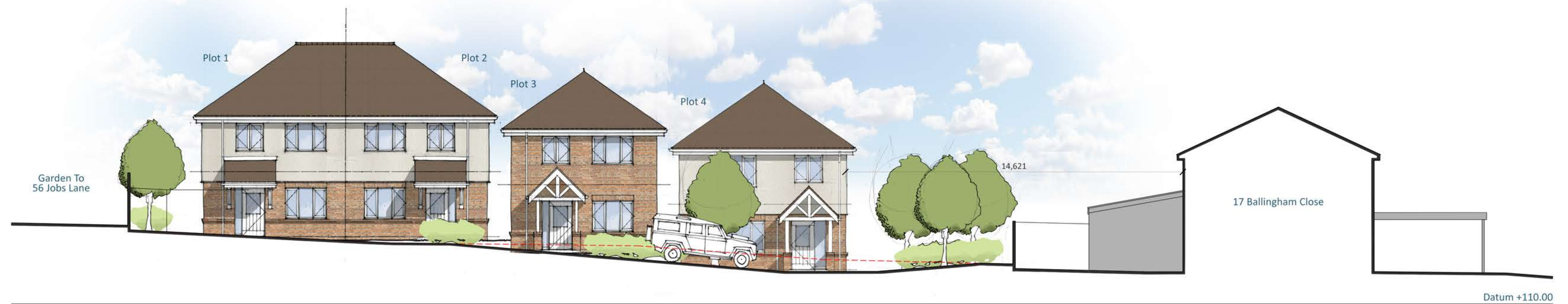
Proposed Street Scene Scale 1:100