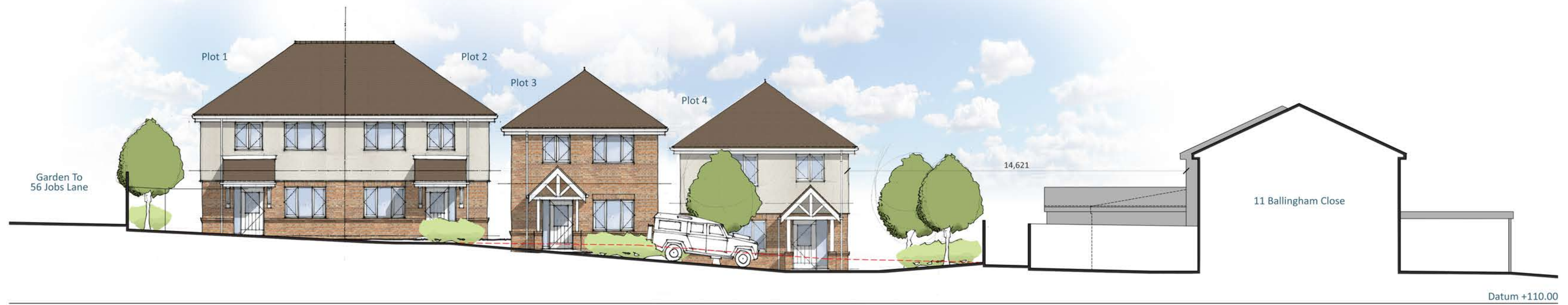
Proposed Street Scene Scale 1:100